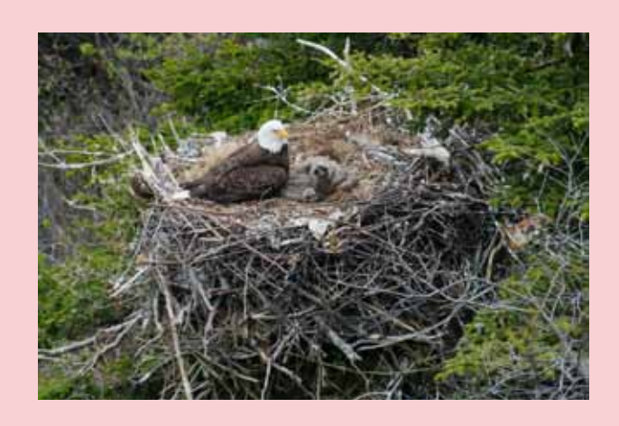
Share the knowledge: pass me to a friend.

As you can see, I don't fear much and my large size makes me an amazing hunter. I can even fly with a catch of the same weight as myself.