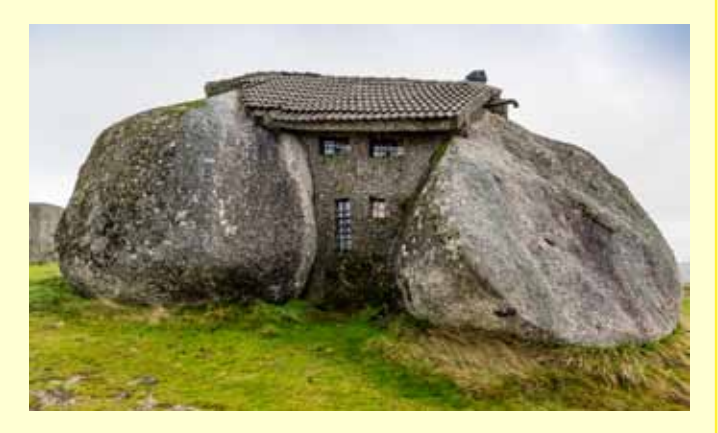
Many old houses are made of stones, but not quite as dramatically as this one!